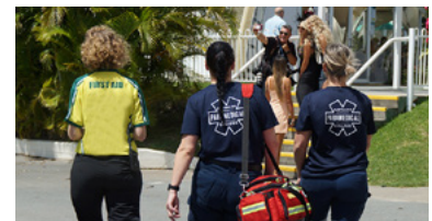
Event Medic/First Responder/ Emergency Medical Technician