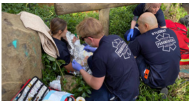
Paramedic (via a university pathway)

Here are some of the most popular career outcomes :