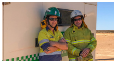
Medical Emergency Services Officer (ESO)